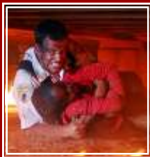
Kirk Cameron stars in "Fireproof"

"I've spent my entire life trying to win in two different pro sports. What I appreciate about FIREPROOF is that it's an entertaining and challenging reminder of what it takes to win in marriage!" - Joe Gibbs