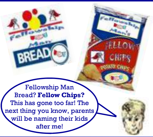
* Last Issue

Fellowship Man Bread? Fellow Chips? This has gone too far! The next thing you know, parents will be naming their kids after me!