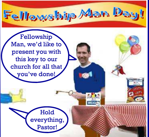
* Matthew 5:16 (NIV)

I don't want people praising me ! I just want Christians to get connected with one another so they can strengthen their connection with Christ!