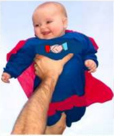
Local Pastor Presents Biblical Reality