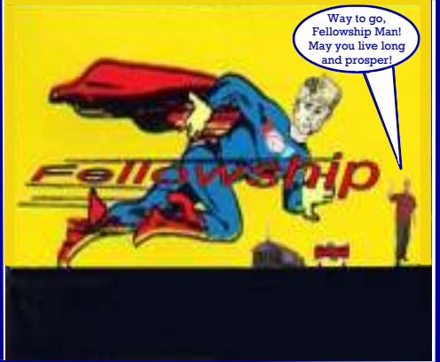
* Romans 12:5 (NIV)

Way to go, Fellowship Man! May you live long and prosper!